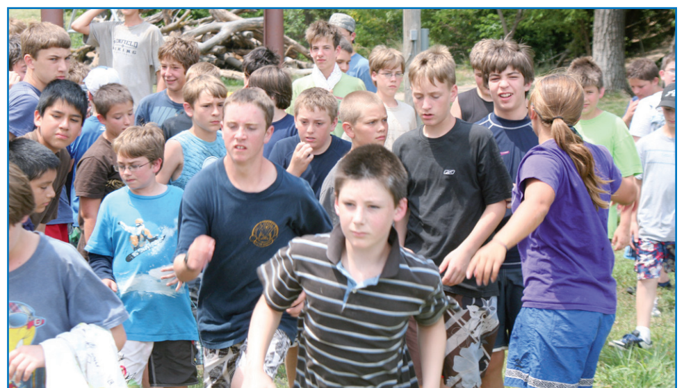
Students enjoy a variety of activities during a recent camp at Camp Wa-Ja-To, south of Lyons.